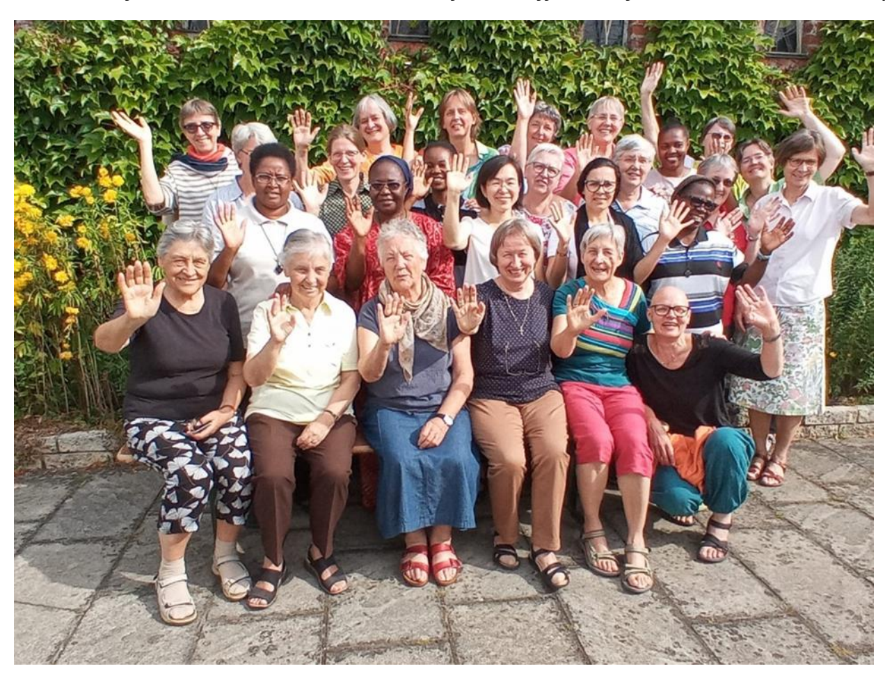
Dear Sisters, Dear Members of the Weggemeinschaft,

Christ set us free, so that we should remain free – different lifeworlds, one community