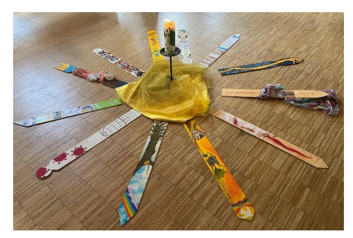
Every sister bears witness to Jesus Christ with

her own life. The look ahead, the long breath, the faithfulness and above all the great trust in God moved the assembly.